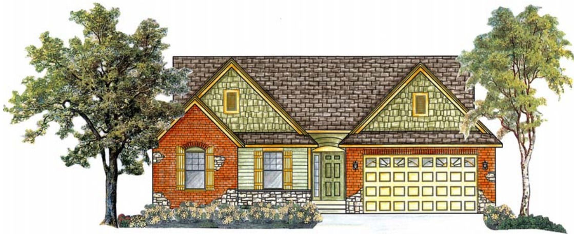
FRENCH COUNTRY ELEVATION