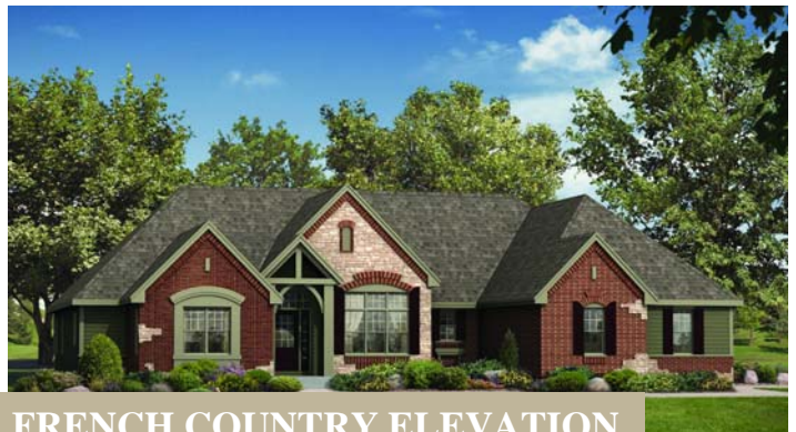
FRENCH COUNTRY ELEVATION