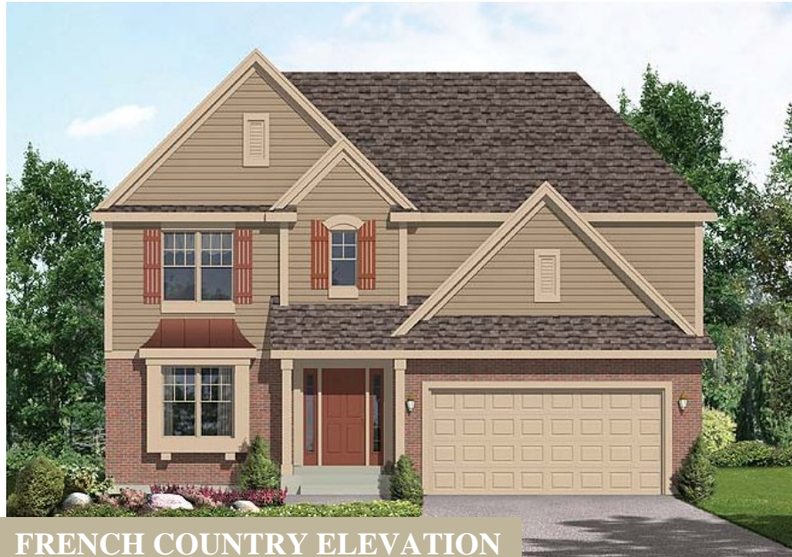
FRENCH COUNTRY ELEVATION