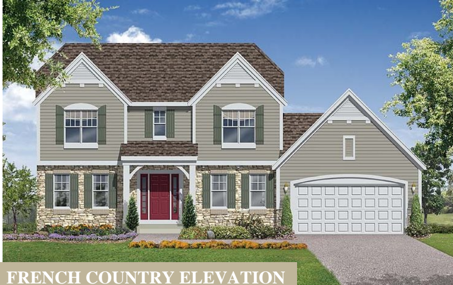
FRENCH COUNTRY ELEVATION