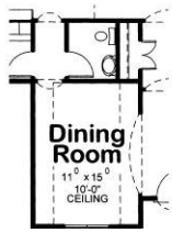
OPTIONAL DINING ROOM