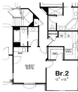
OPTIONAL GUEST SUITE OR OFFICE