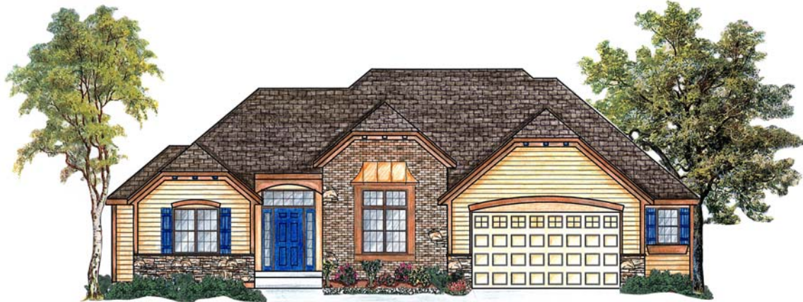
FRENCH COUNTRY ELEVATION